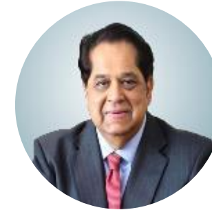
K V Kamath Non Executive Director ICICI Bank